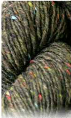
FOREST GREEN D4715