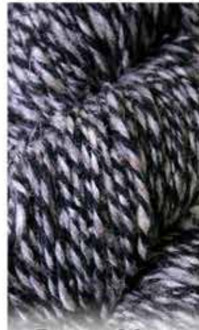
BLACK MARL D9017